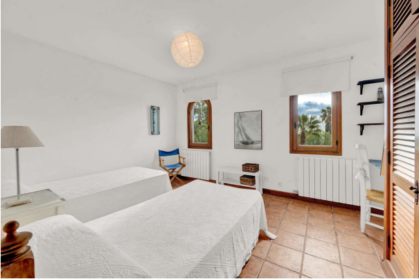
Guest bedroom in Sol de Mallorca