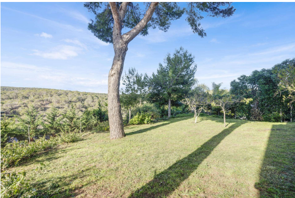
Garden in a villa for sale