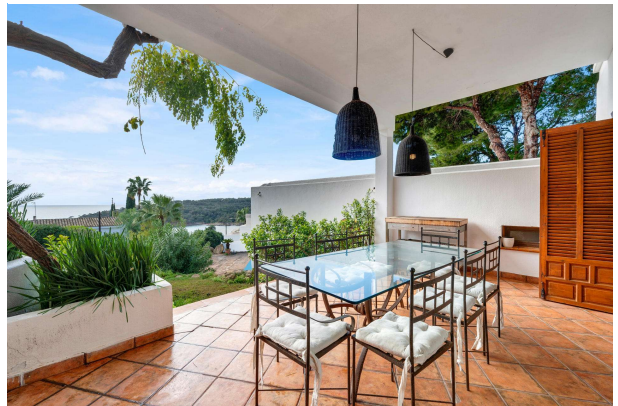
Terrace with sea views in Sol de Mallorca