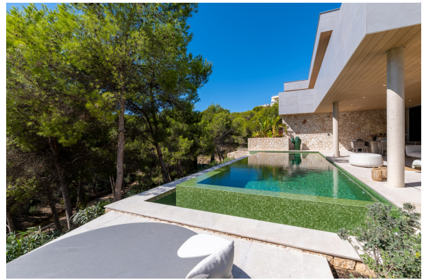
Kensington - Floresta Villa