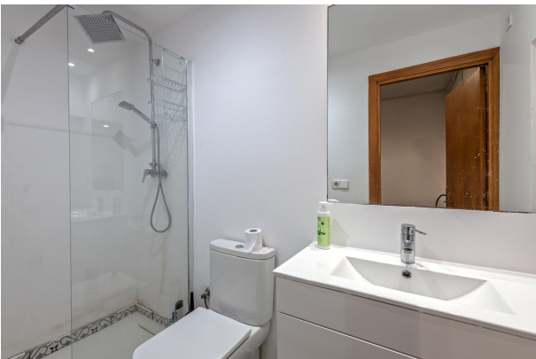
1st floor bathroom