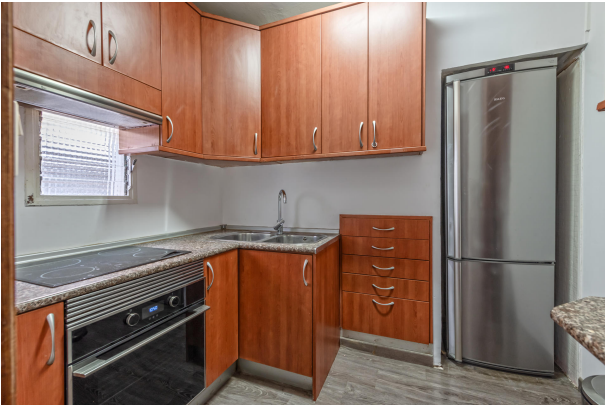
1st floor kitchen