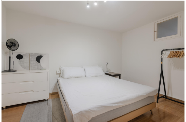
1st floor bedroom I