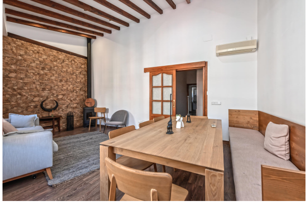
1st floor living area