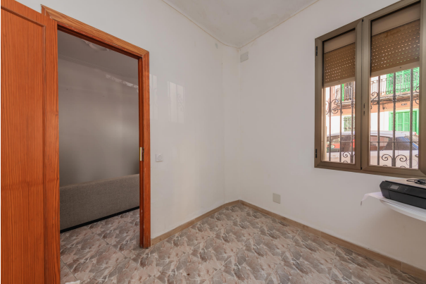
Ground floor living room