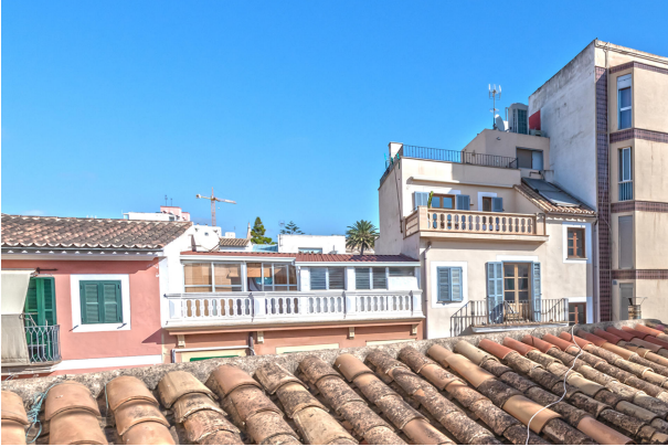
View rooftop terrace