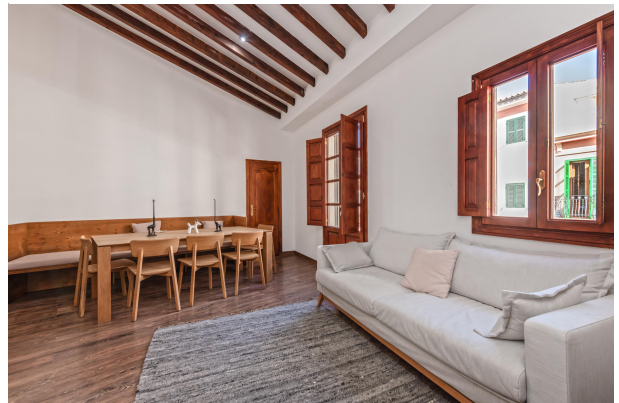
1st floor living area