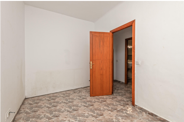
Ground floor bedroom loom