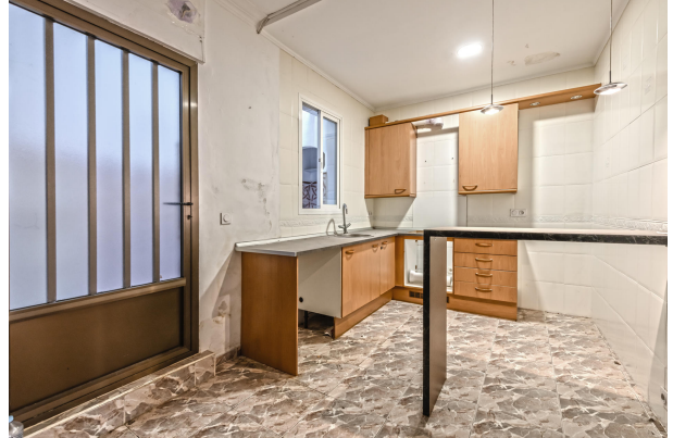
Ground floor kitchen