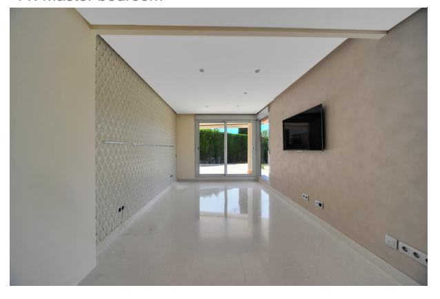
11. Master bedroom