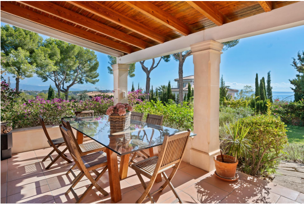
ChatGPT Beautiful outdoor area with a large pool