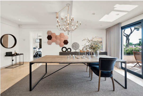
Nice dining area