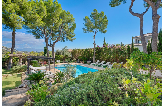
Beautiful outdoor area with a large pool