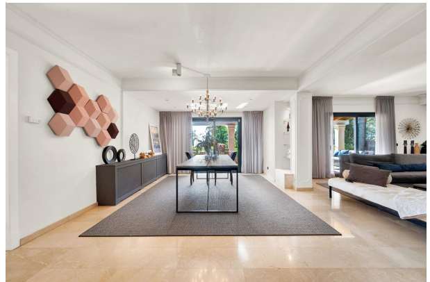
Beautiful dining area