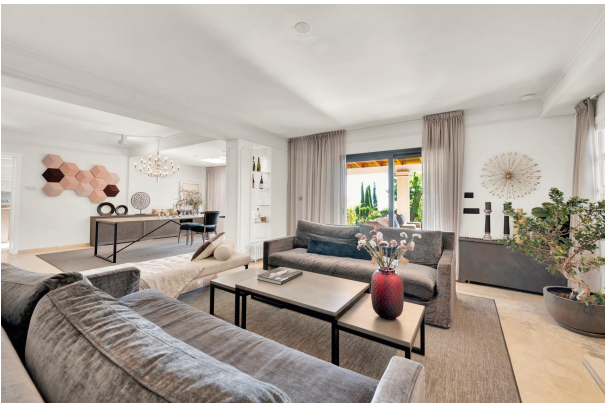
Modern designer living room