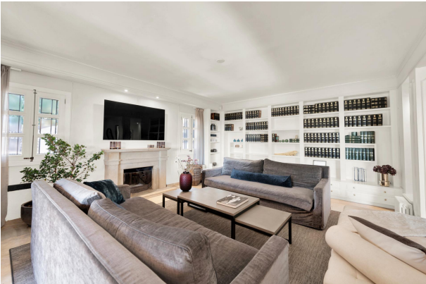
Bright living room