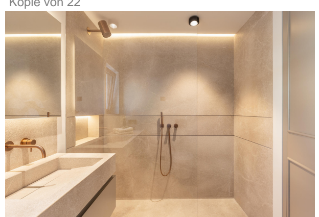
Kopie von 22