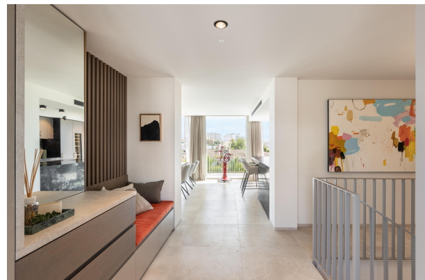
Kopie von 6