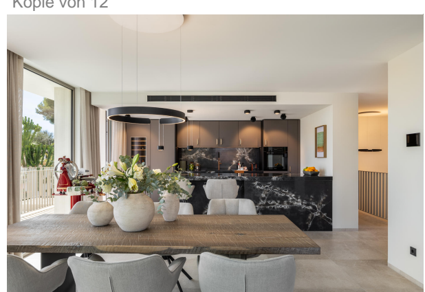
Kopie von 12