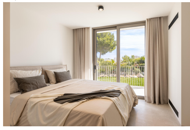
Kopie von 21