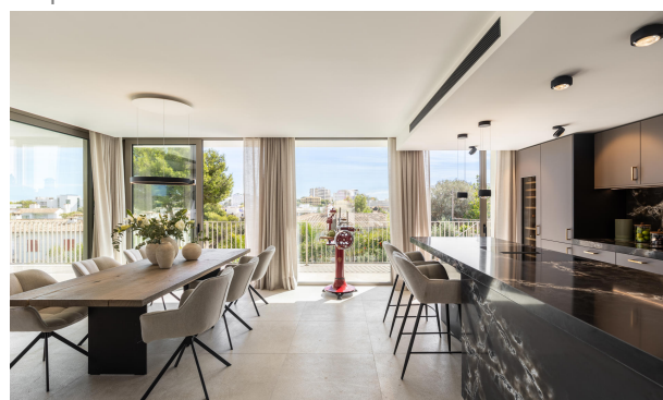
Kopie von 8