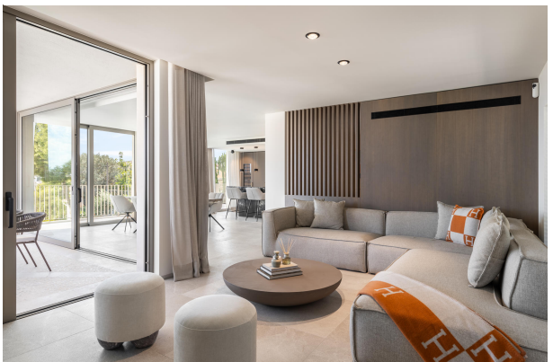
Kopie von 16