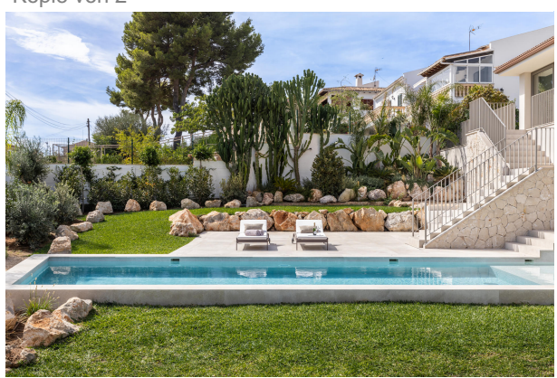
Kopie von 3