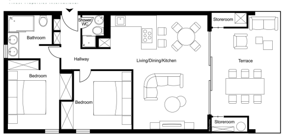
1. Geschoss (1st Floor)

38008_662124_1782946_KPO01568_KPO01568_Gru ndriss_page-0001_1_jpg_Apartment_1900_2300_jpg.j pg