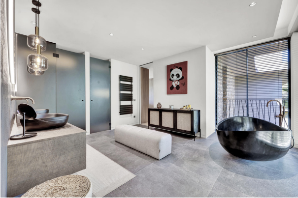
Modern and big bathroom