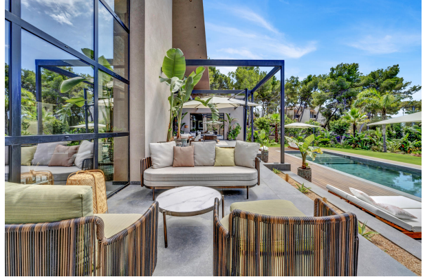
Terrace area with pool