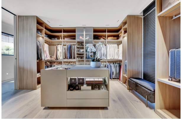
Beautiful dressing room