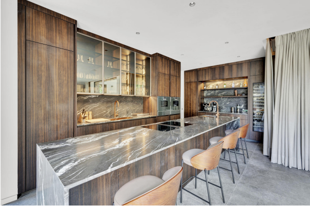
Modern and open kitchen