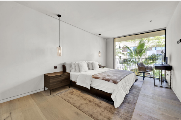
Modern and big bedroom