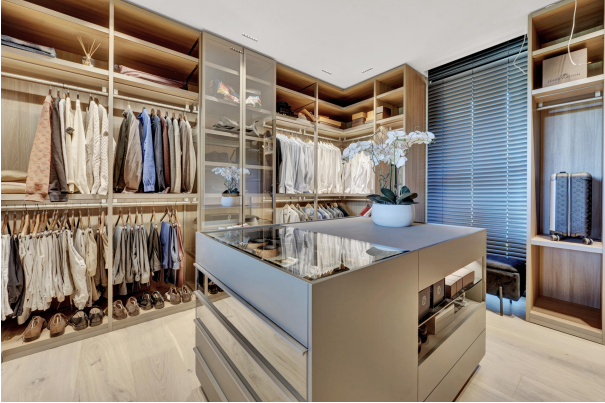
Modern dressing room