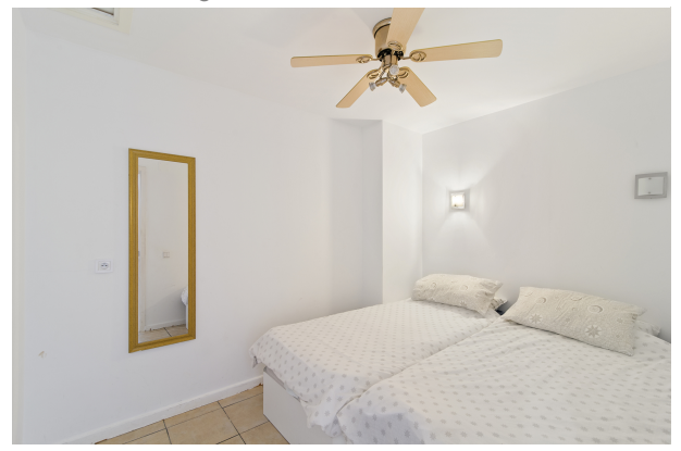
Bedroom in Magaluf