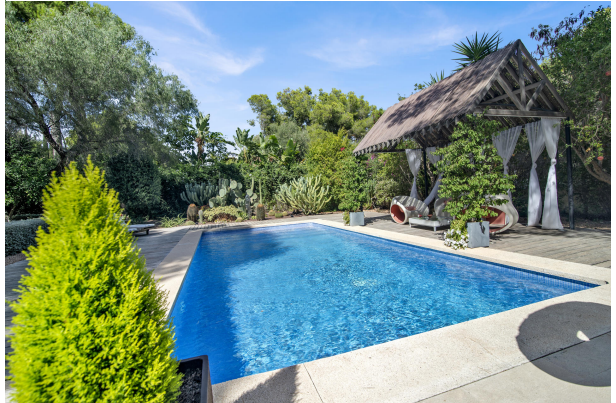
Villa with pool