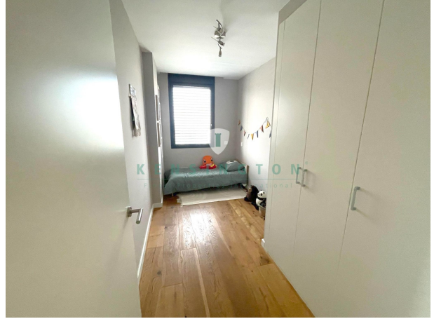
WhatsApp Image 2024-02-23 at 13.59.58 (3)