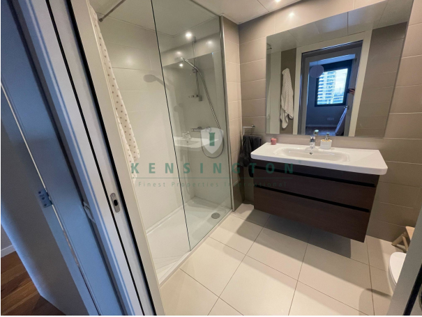
WhatsApp Image 2024-02-23 at 13.59.56 (2)