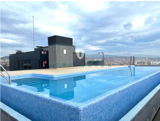
WhatsApp Image 2024-02-23 at 13.59.58 (2)