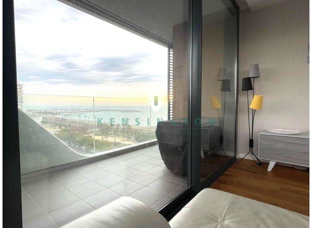
WhatsApp Image 2024-02-23 at 13.59.57 (3)