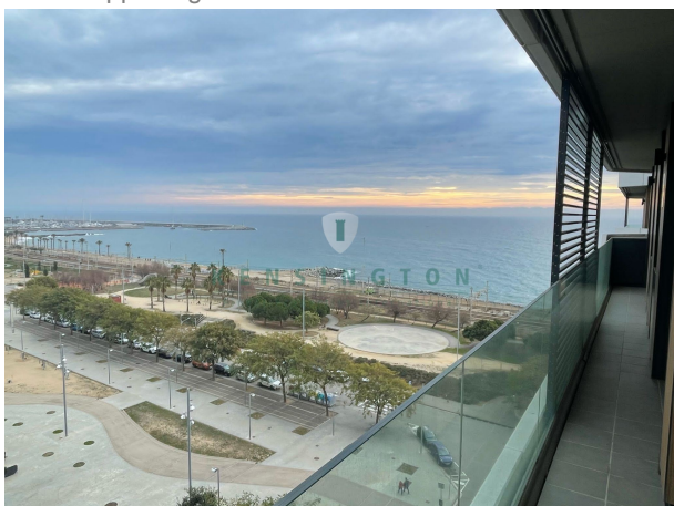
WhatsApp Image 2024-02-23 at 13.59.57 (8)