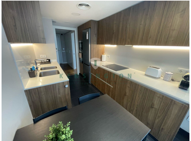
WhatsApp Image 2024-02-23 at 13.59.56 (8)