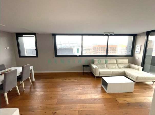
WhatsApp Image 2024-02-23 at 13.59.57 (7)