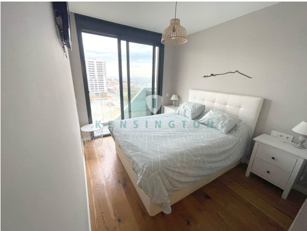
WhatsApp Image 2024-02-23 at 13.59.57 (2)