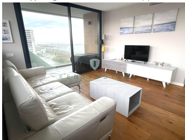
WhatsApp Image 2024-02-23 at 13.59.57 (6)