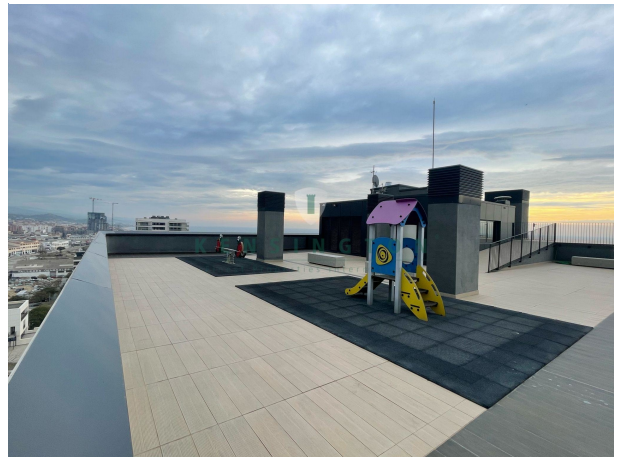
WhatsApp Image 2024-02-23 at 13.59.58 (6)