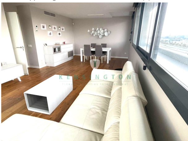
WhatsApp Image 2024-02-23 at 13.59.58 (1)