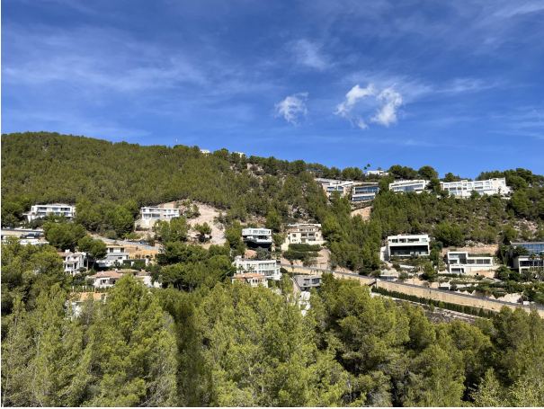
Plot and street