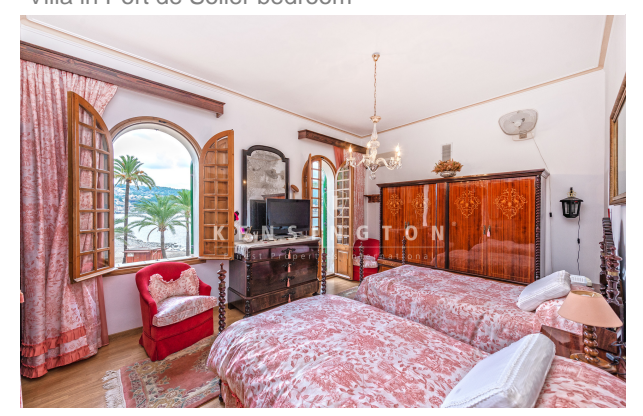
Villa in Port de Soller bedroom