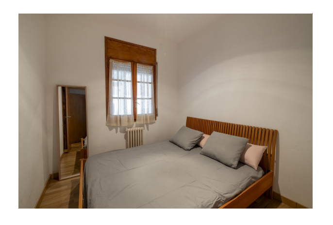
folch i torres_17