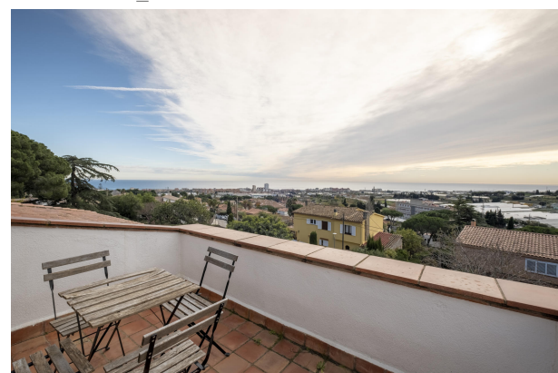
folch i torres_47