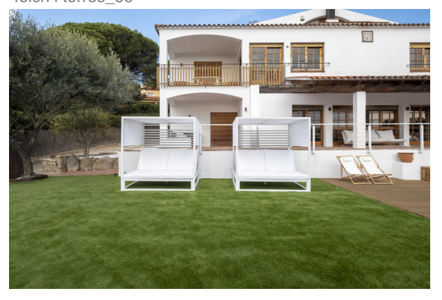
folch i torres_66