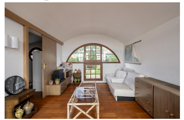
folch i torres_46