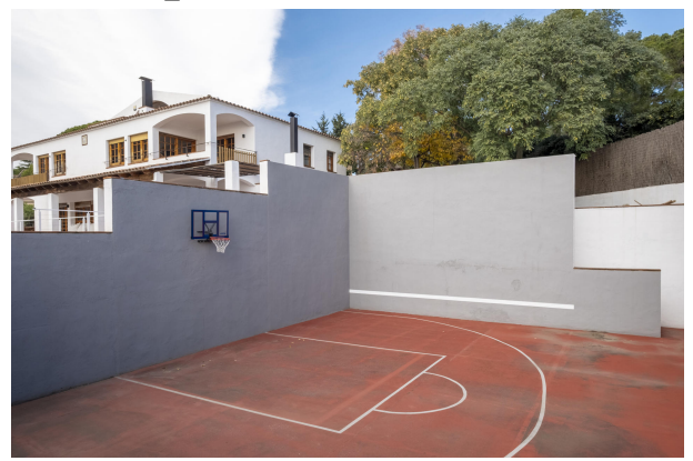
folch i torres_71