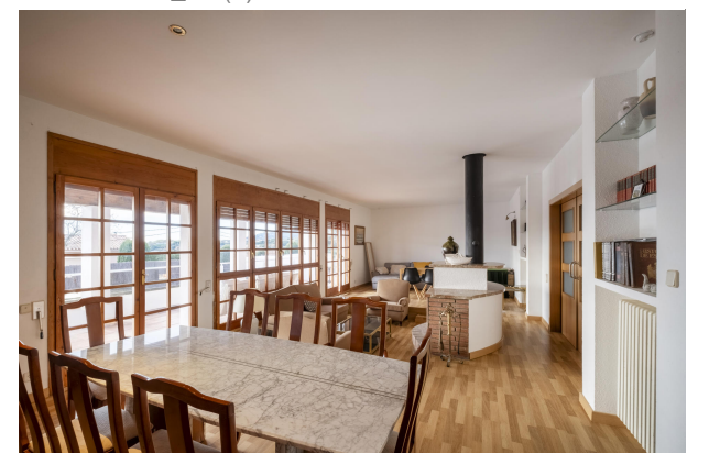
folch i torres_06 (1)