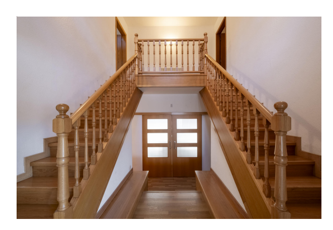
folch i torres_19