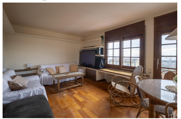
folch i torres_34