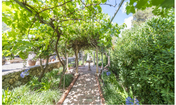
KPI1379 - Finca en venta - Finca zu verkaufen - Finca for sale - Finca te koop -