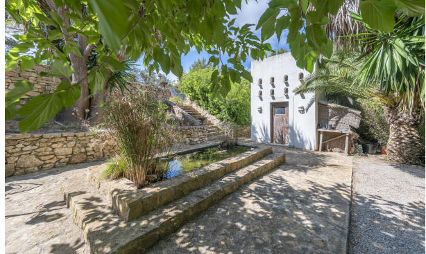
KPI1379 - Finca en venta - Finca zu verkaufen - Finca for sale - Finca te koop -