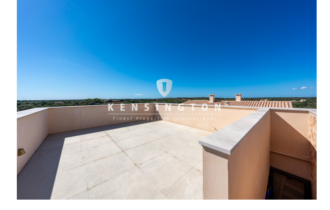
terrace with great views