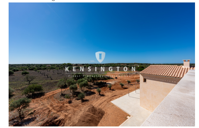
terrace with great views