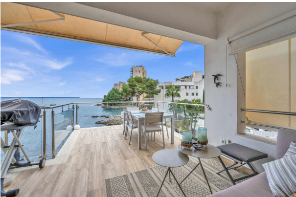
Sea view terrace in Cas Catala