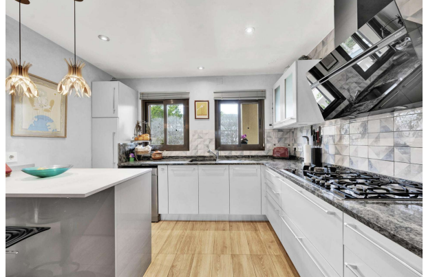
Kitchen in apartment for sale in Cas Catala