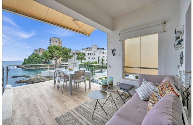
First sea line apartment