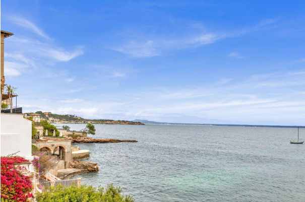
Sea views from apartment for sale