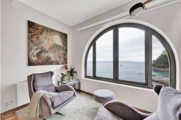
Sea view apartment for sale