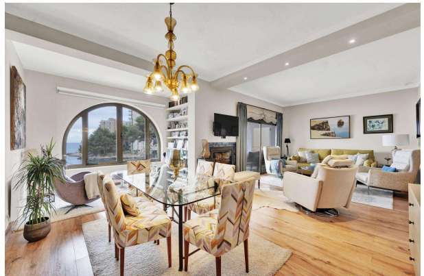
Sea view apartment