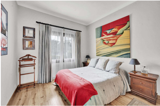
Bedroom in apartment for sale Cas Catala