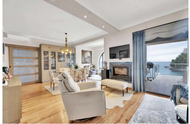
Living room in Cas Catala