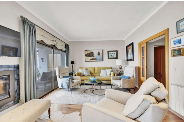
Frontline apartment for sale