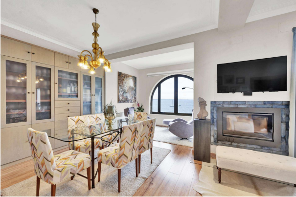
Dining area in Cas Catala