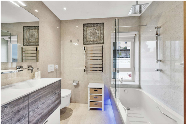
Bathroom in frontline apartment for sale