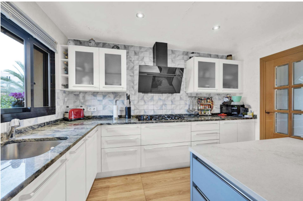
Kitchen in Cas Catala