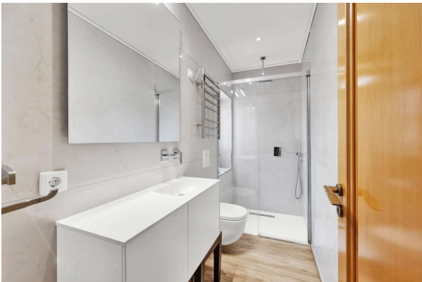
Bathroom in Cas Catala