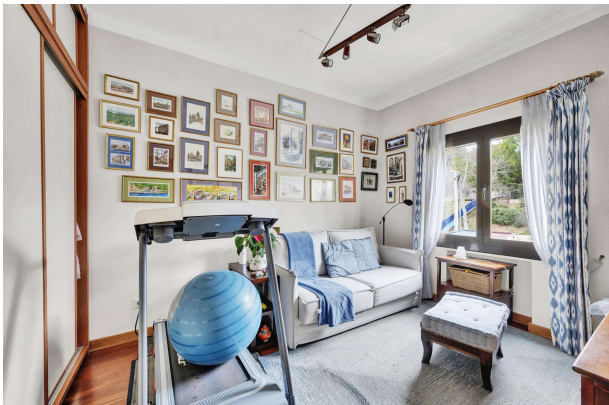
Bedroom in Cas Catala