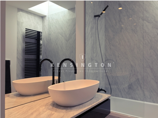
Apartment Palma Old Town Bathroom