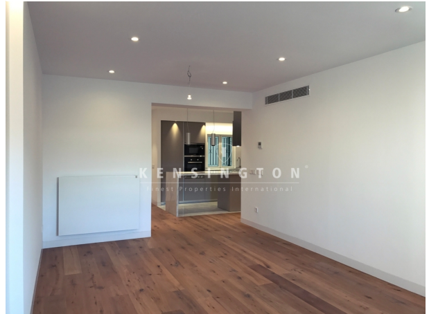
Apartment Palma Old Town Living room