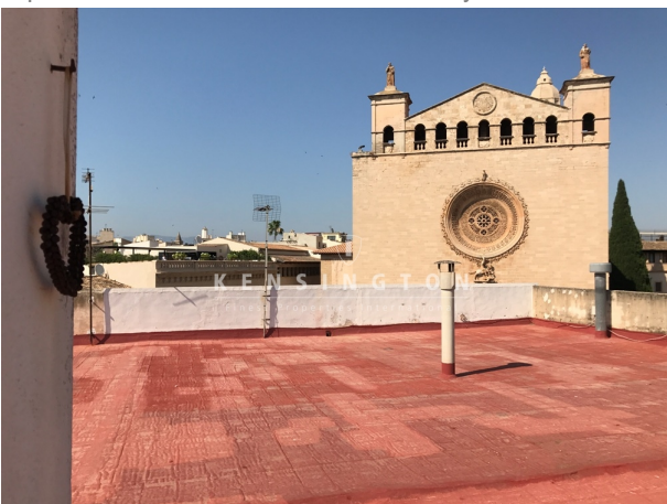
Apartment Palma Old Town Community terrace