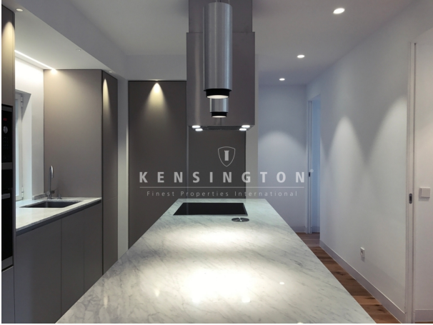
Apartment Palma Old Town Kitchen