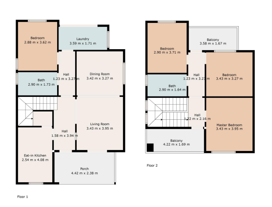
TOTAL: 131 m2 FLOOR 1: 76 m2, FLOOR 2: 55 m2 EXCLUDED ARBAS: PORCH: 11 m2, BALCONY: 13 m2 Measurements Deemed highly Entitle but 160 Electroneed.