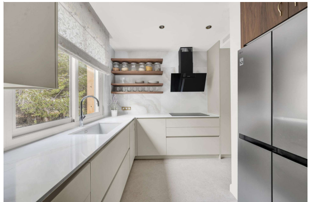
Kitchen in Sol de Mallorca