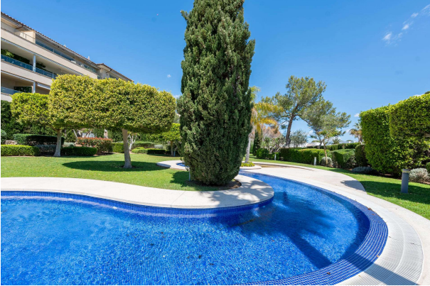
KPO01675 swimming pool