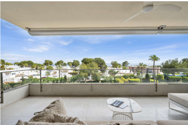
Sea view terrace in Sol de Mallorca