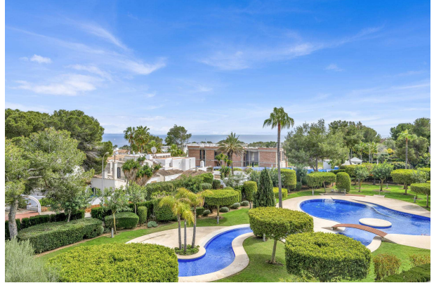
Swimming pool in Sol de Mallorca