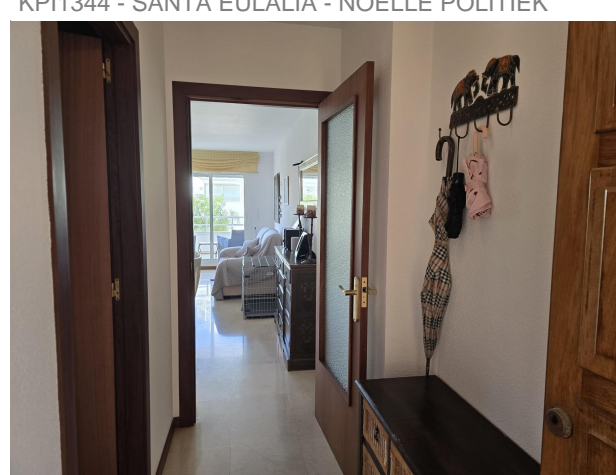
KPI1344 - SANTA EULALIA - NOELLE POLITIEK