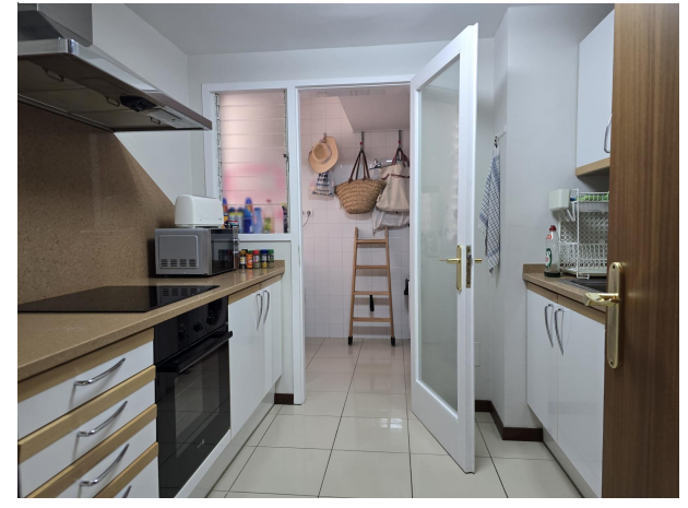
KPI1344 - SANTA EULALIA - NOELLE POLITIEK