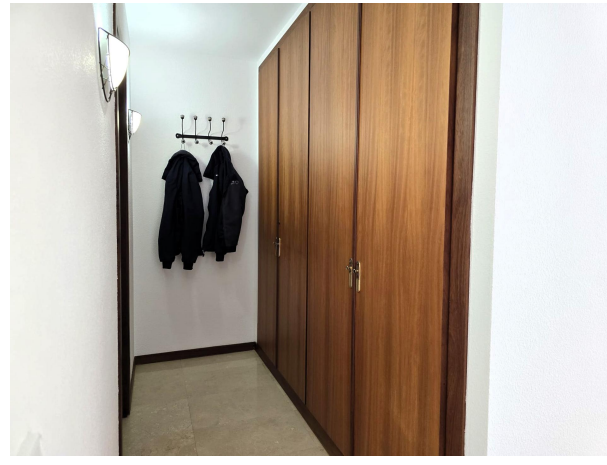
KPI1344 - SANTA EULALIA - NOELLE POLITIEK