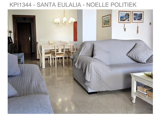
KPI1344 - SANTA EULALIA - NOELLE POLITIEK