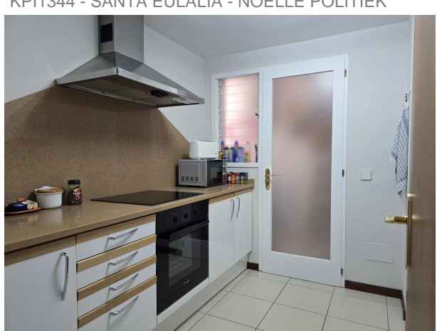
KPI1344 - SANTA EULALIA - NOELLE POLITIEK