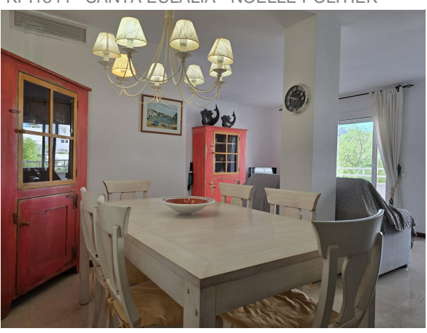
KPI1344 - SANTA EULALIA - NOELLE POLITIEK