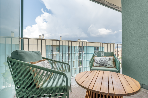
1.3 TERRAZA 4