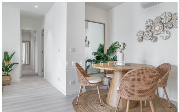
4.1 COMEDOR OK