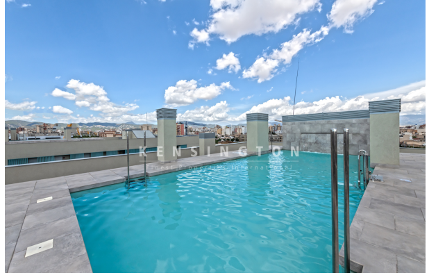
2.4 PISCINA 3