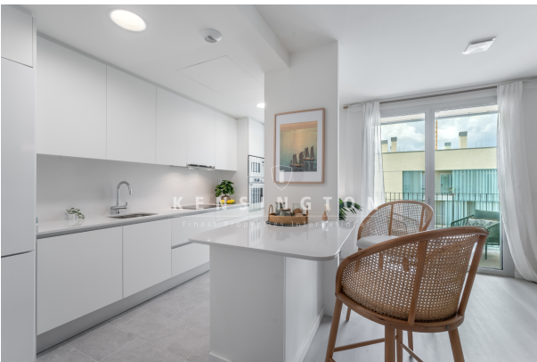
4.1 COCINA 1