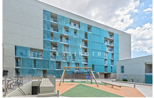
1.4 TERRAZA 3