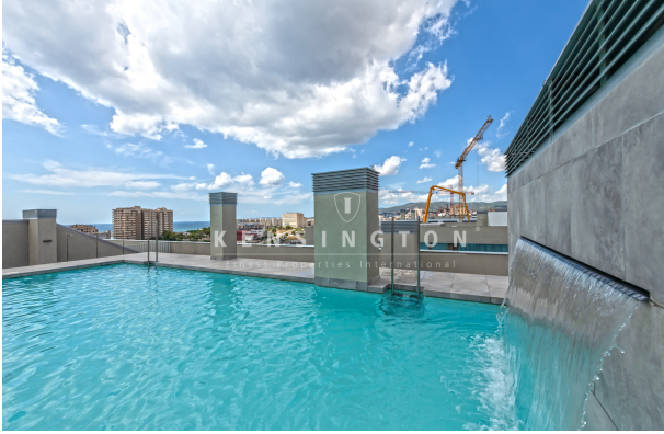
1.2 TERRAZA 2