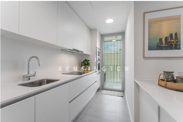
4.2 COCINA 2