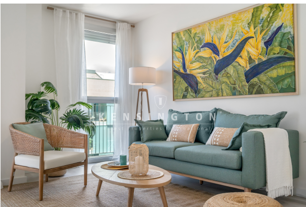
3.3 SALON 2