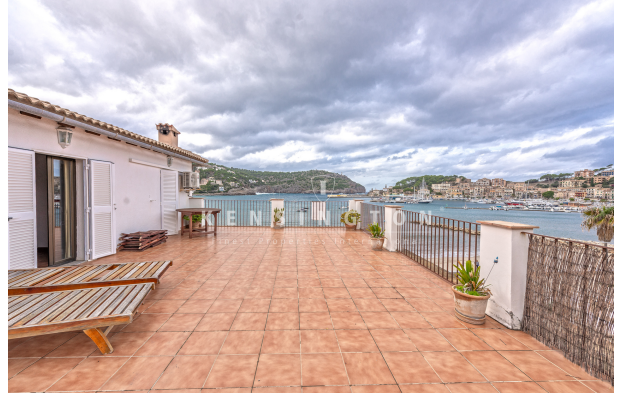
Soller-Living and commercial-Terrace with sea view