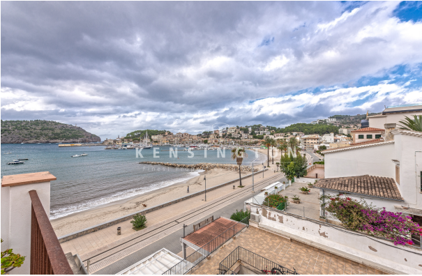
Soller-Commercial-Terrace with sea view