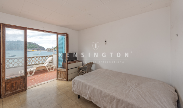
Soller- House for living-Bedroom with terrace and sea view