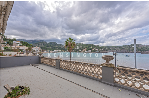
Soller-Investment-Terrace first sea line