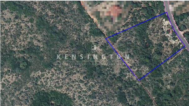
Bird view plot