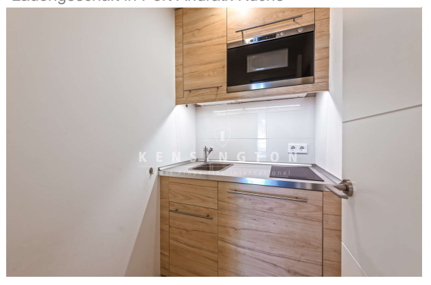
Ladengeschäft in Port Andratx Küche