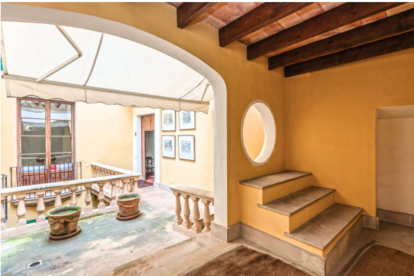
Patio (1st floor)