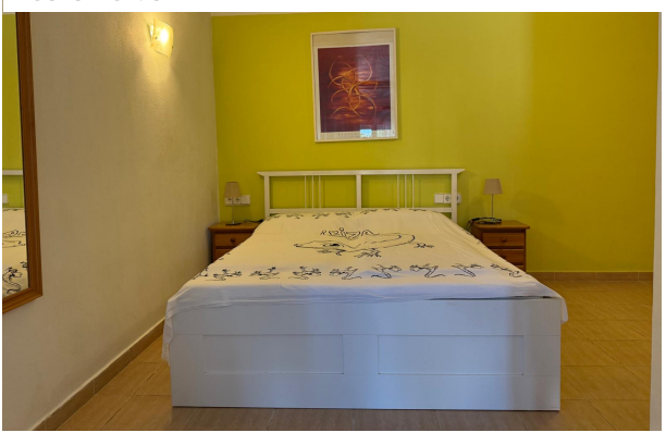
KPI1364 - Casa en venta - Haus zu verkaufen - House for sale - Huis te koop - www.kensington-ibiza.com - Noelle Politiek