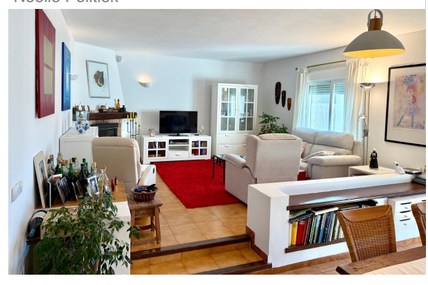
KPI1364 - Casa en venta - Haus zu verkaufen - House for sale - Huis te koop - www.kensington-ibiza.com - Noelle Politiek