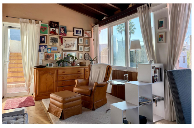
KPI1364 - Casa en venta - Haus zu verkaufen - House for sale - Huis te koop - www.kensington-ibiza.com - Noelle Politiek