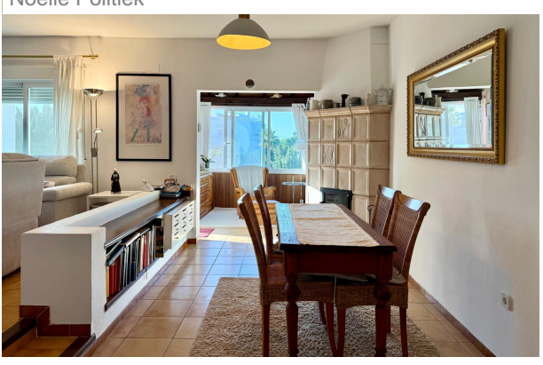
KPI1364 - Casa en venta - Haus zu verkaufen - House for sale - Huis te koop - www.kensington-ibiza.com - Noelle Politiek