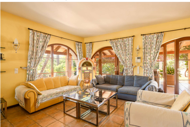
v2 _estudi97_ (HQ)-9