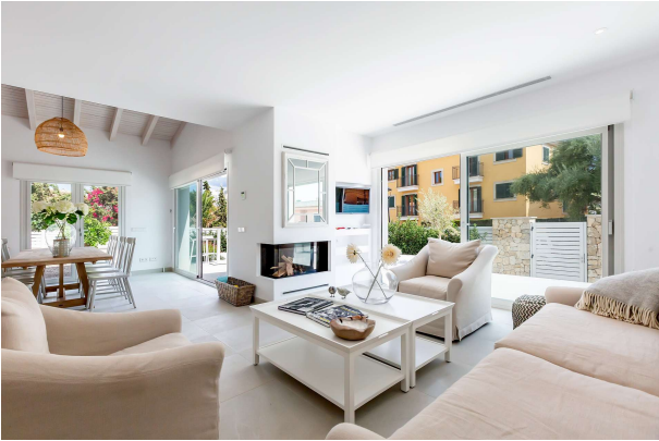
Almudaina 26 villa-1187