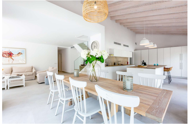
Almudaina 26 villa-1220