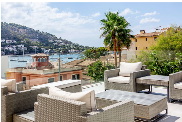
Almudaina 26 villa-6077