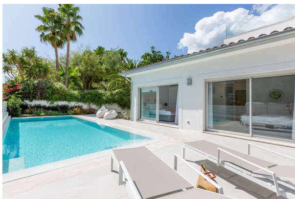
Almudaina 26 villa-0734