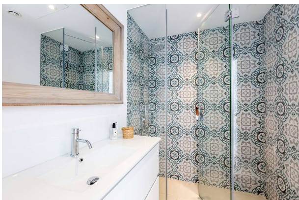
Almudaina 26 villa-1145