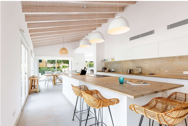
Almudaina 26 villa-1280