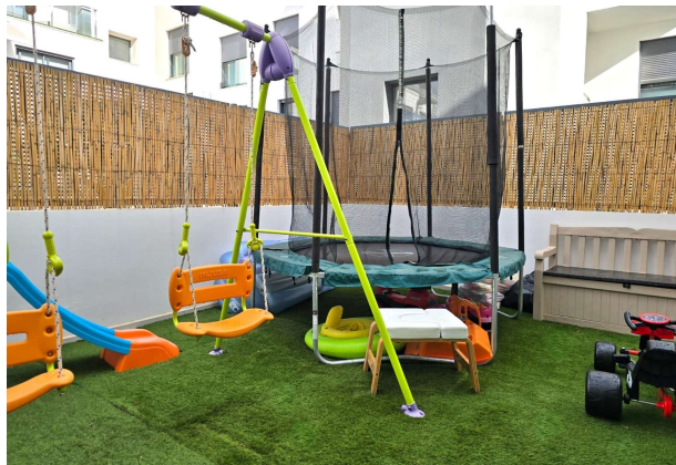
KPI1368 - Duplex en venta - Duplex zu verkaufen - Duplex for sale - Duplex te ko