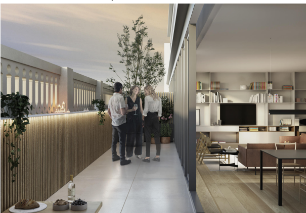
210612 noche c02 fp2