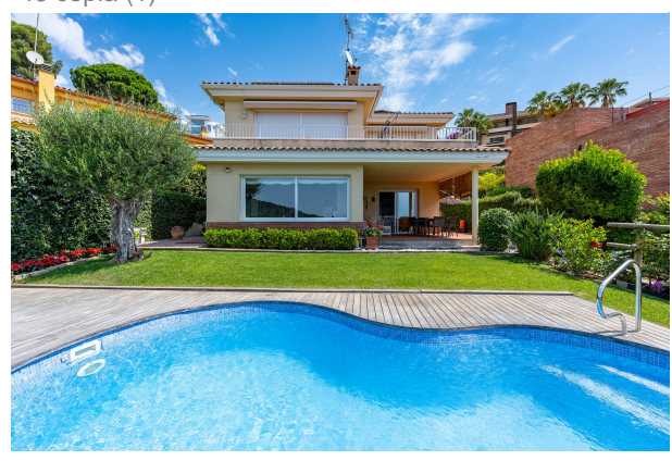
46 copia (1)