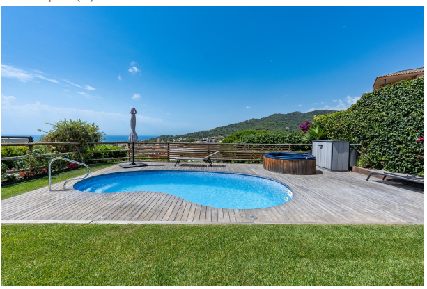
43 copia (1)