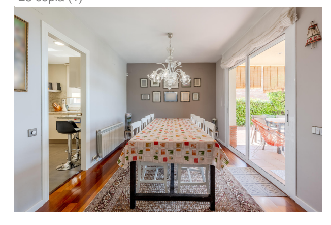
28 copia (1)