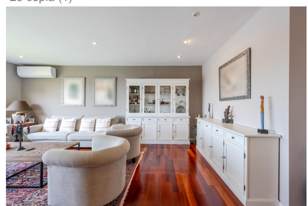
29 copia (1)