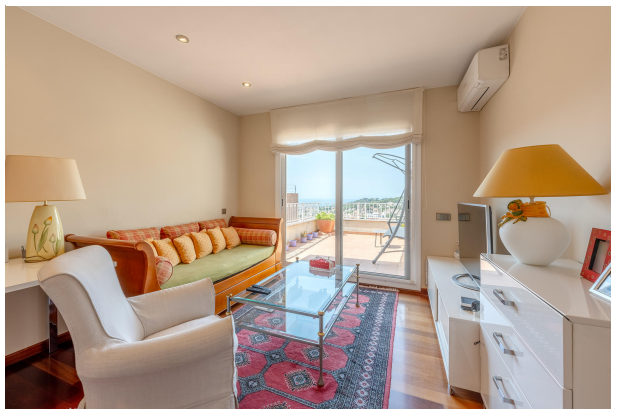
3 copia (1)