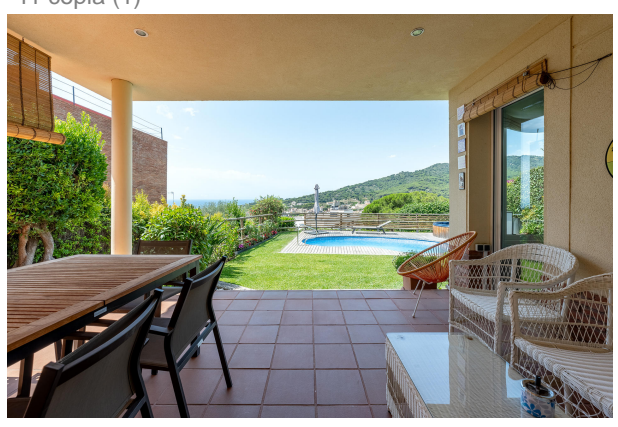
41 copia (1)