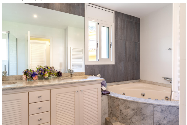
35 copia (1)