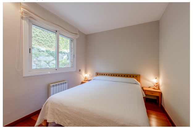
30 copia (2)