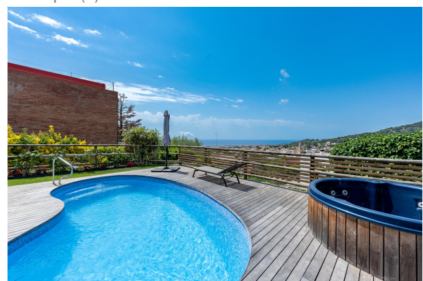
44 copia (1)