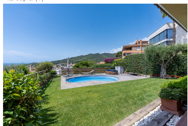
42 copia (1)