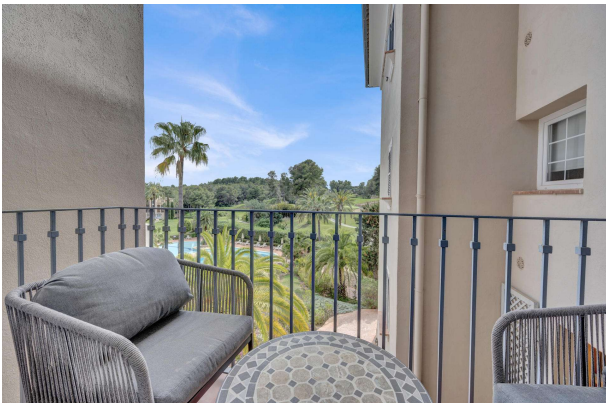
Terrace in Golf Bendinat