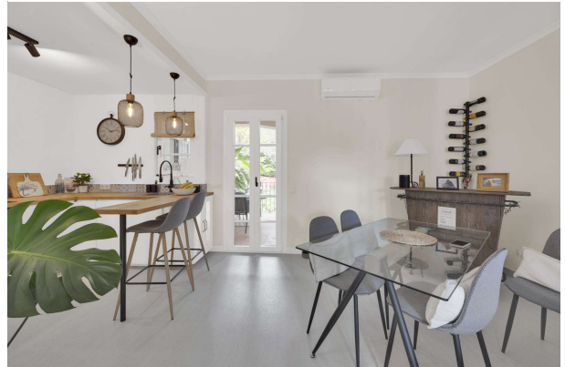
Apartment in Bendinat KPO01736