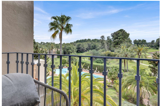
Terrace with a pool views