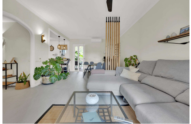
Living room in Bendinat