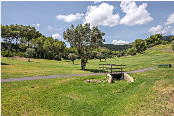
Golf 1 Bendinat