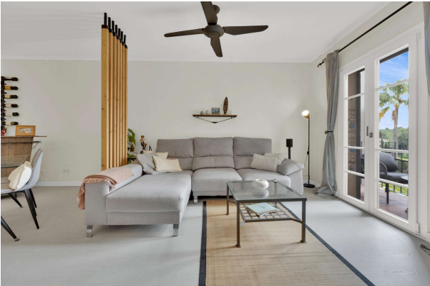
Living room in Golf Bendinat