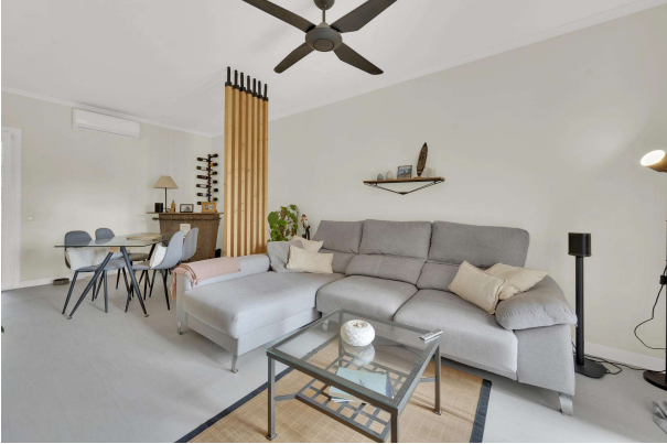
Spacious living room