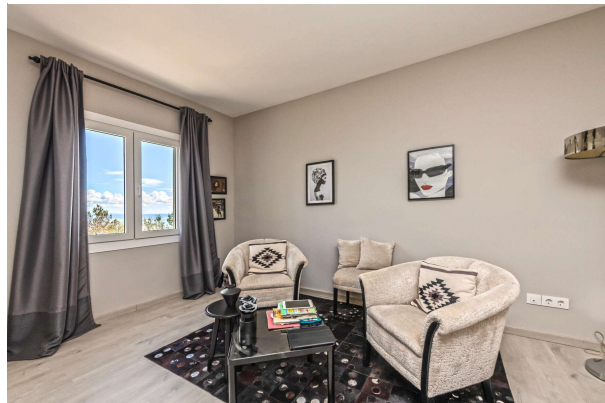
Bedroom II (ground floor)