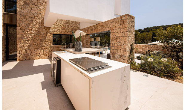
KPI1006 - Villa en venta - Villa zu verkaufen - Villa for sale - Villa te koop -