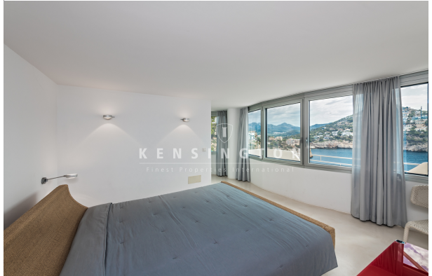
Apartment in Pt Andratx Mallorca - bedroom