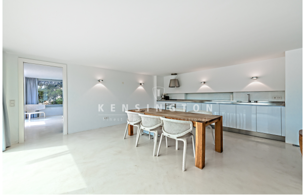
Apartment in Pt Andratx Mallorca - kitchen/dining