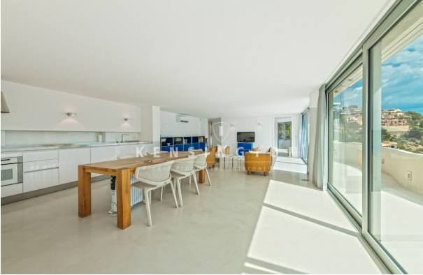
Apartment in Pt Andratx Mallorca - dining/living area