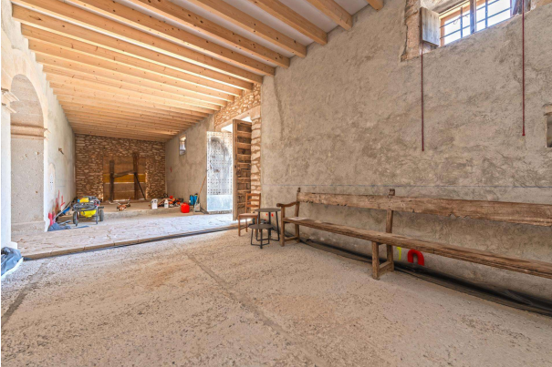
Lower level (living)