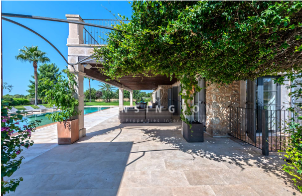
Finca in Santa Maria Terrasse