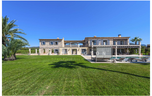
Finca in Santa Maria Pool