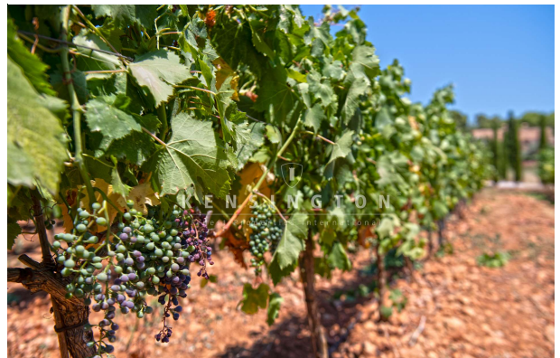
Finca in Santa Maria Kino