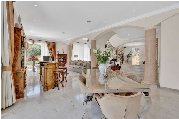
Villa in Torrenova 7