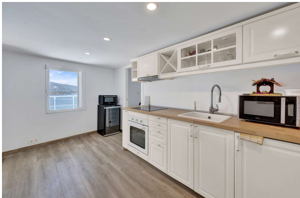
Villa in Torrenova 30