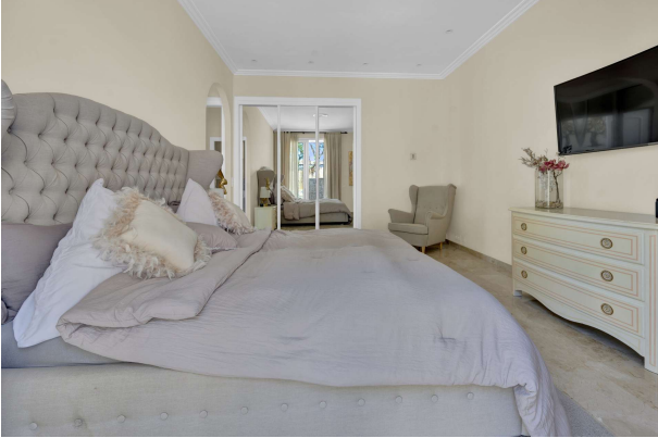
Villa in Torrenova 12