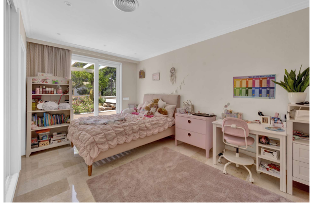
Villa in Torrenova 17