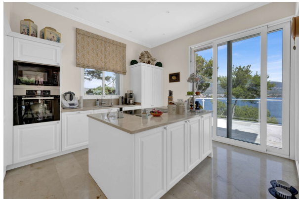
Villa in Torrenova 24