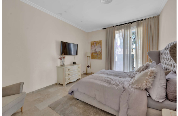
Villa in Torrenova 13