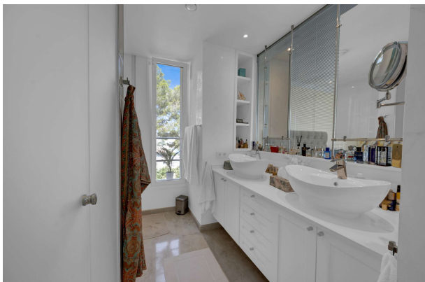
Villa in Torrenova 33