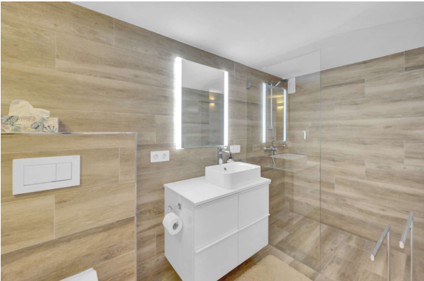
Villa in Torrenova 32