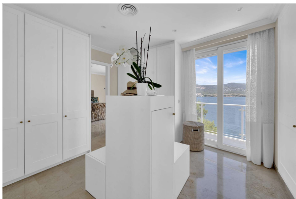
Villa in Torrenova 22