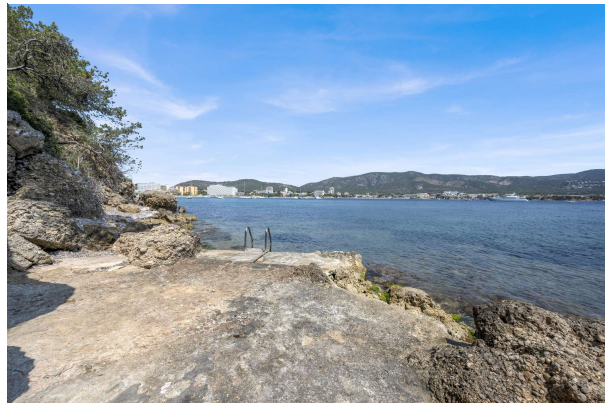
Villa in Torrenova 46