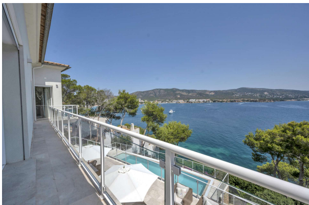
Villa in Torrenova 5