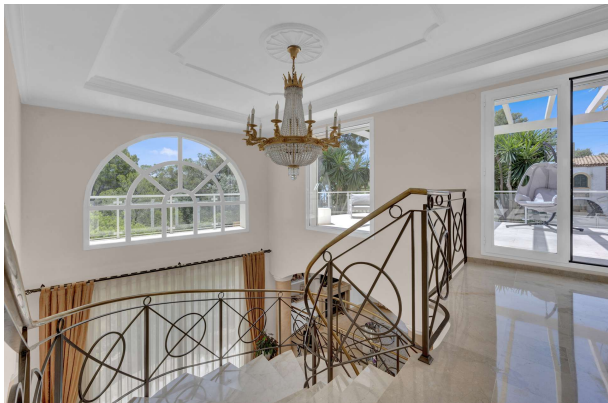
Villa in Torrenova 11