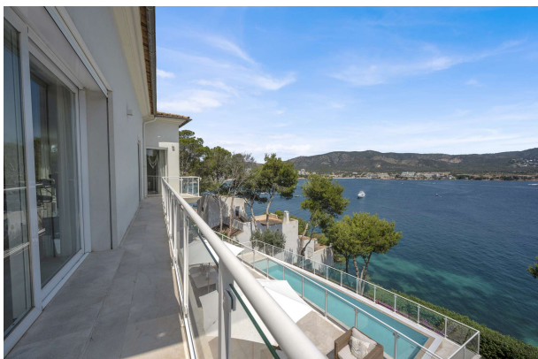
Villa in Torrenova 3