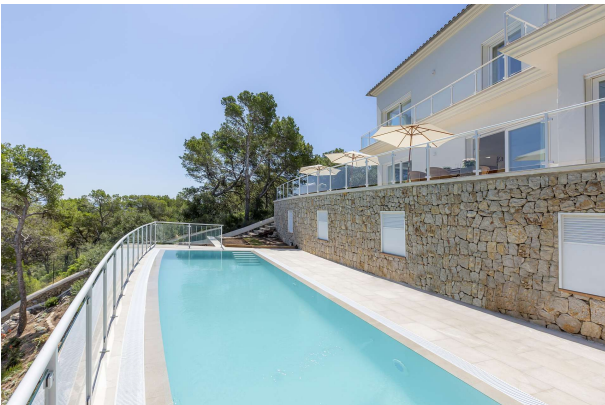
Villa in Torrenova 4