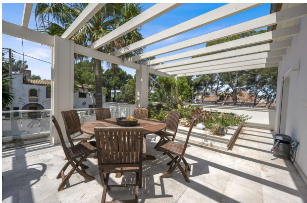
Villa in Torrenova 40