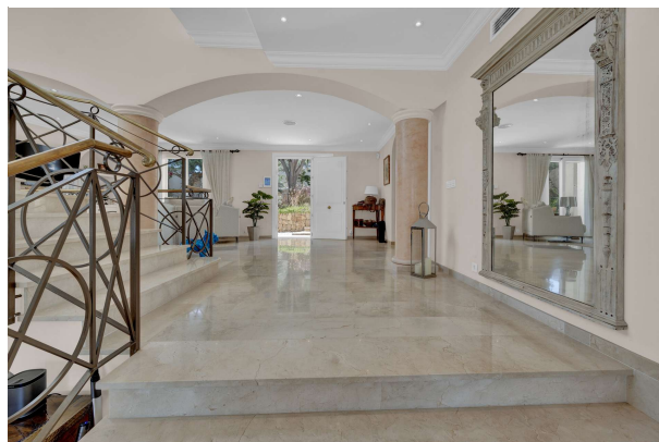
Villa in Torrenova 6