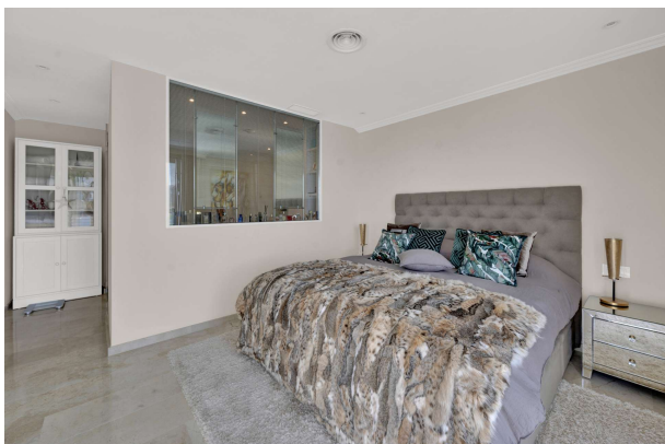
Villa in Torrenova 19