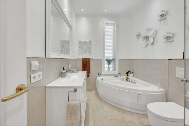
Villa in Torrenova 14