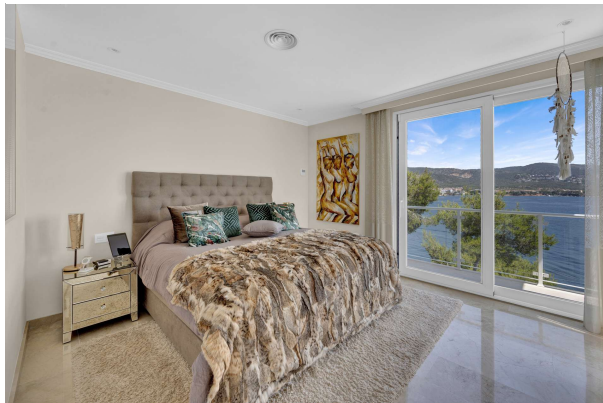
Villa in Torrenova 21