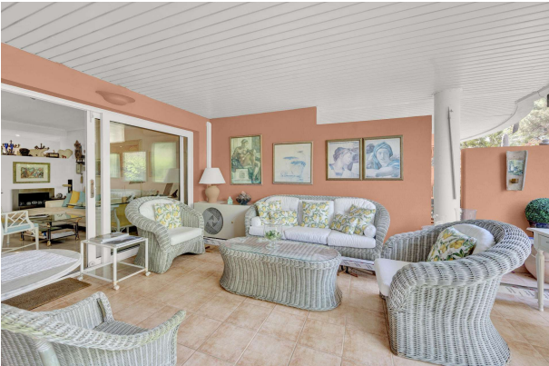
Terrace in Los Altos del Golf Bendinat KPO01737