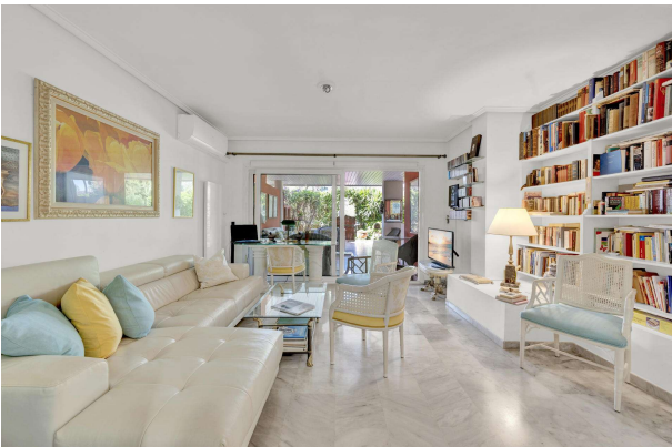
Living room in Los Altos del Golf