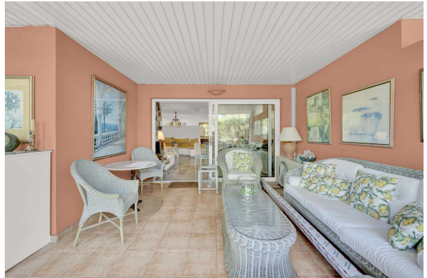
Terrace in Gold Bendinat Los Altos del Golf