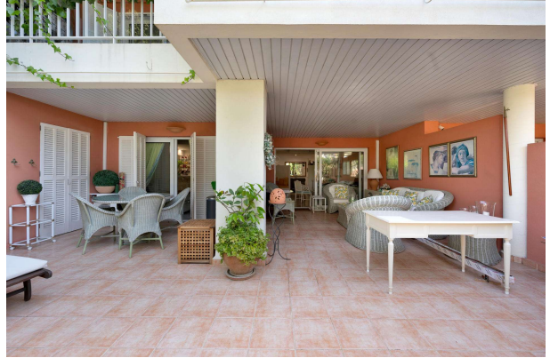
Garden apartment in Bendinat