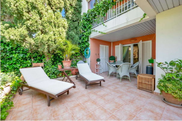
Garden apartment for sale