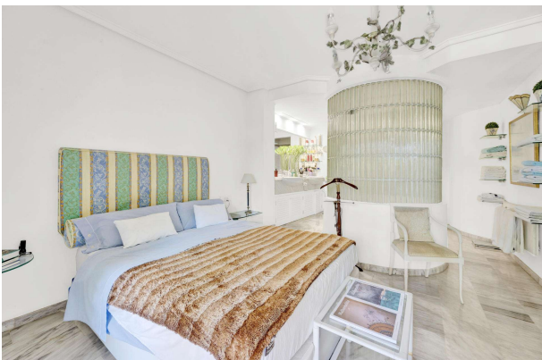
Master bedroom in Bendinat