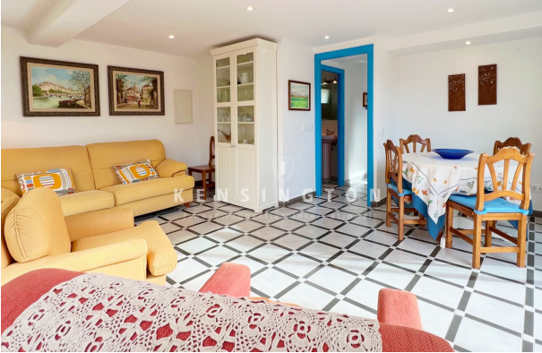
Living R 1