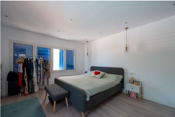
7. Master Bedroom