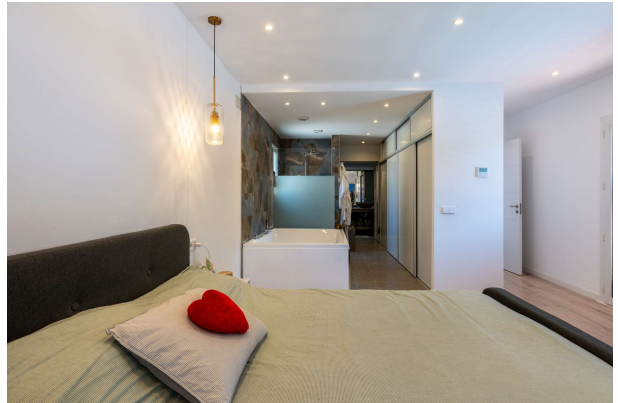
8. Master Bedroom.