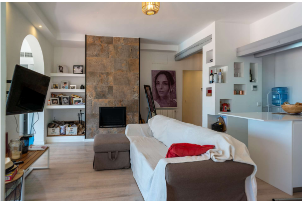
3. Living area