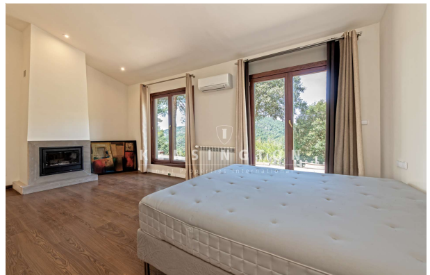
Finca in Esporles Mallorca - schlafzimmer