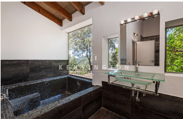
Finca in Esporles Mallorca - badezimmer