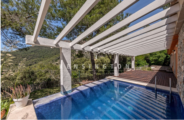
Finca in Esporles Mallorca - pool