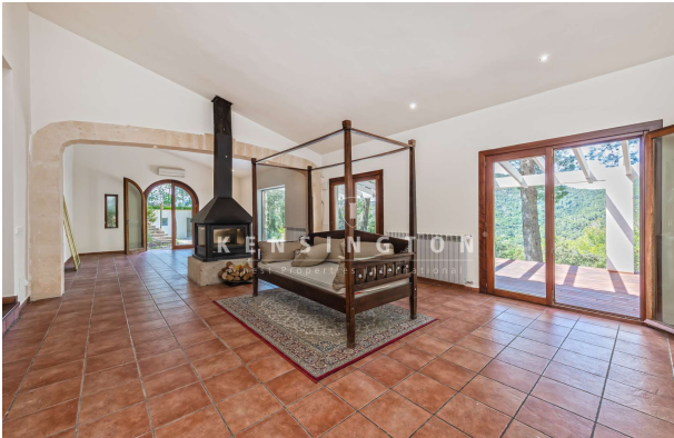
Finca in Esporles Mallorca - wohnzimmer