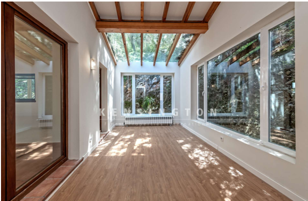
Finca in Esporles Mallorca