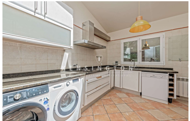
Finca in Esporles Mallorca - küche