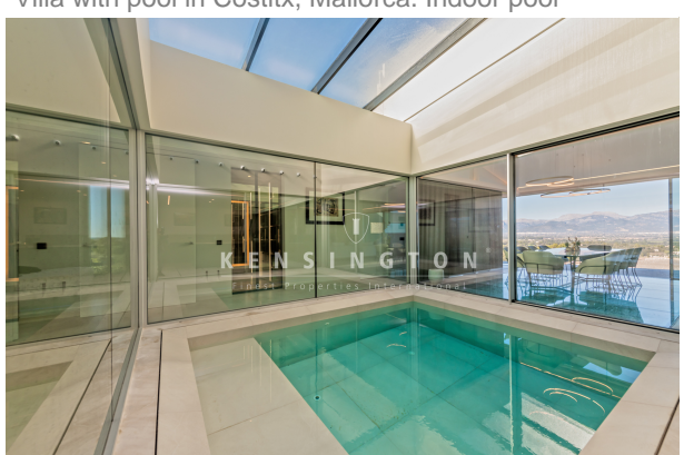
Villa with pool in Costitx, Mallorca. Indoor pool