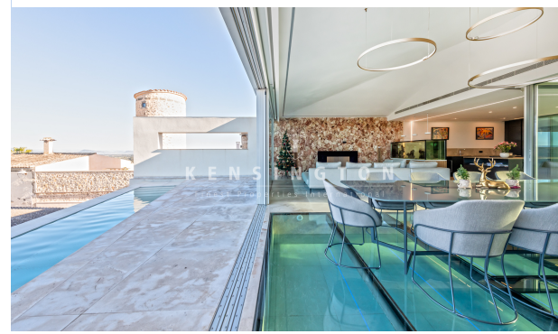
Villa with pool in Costitx, Mallorca. Dining area

Villa with pool in Costitx, Mallorca. Exterior pool and views