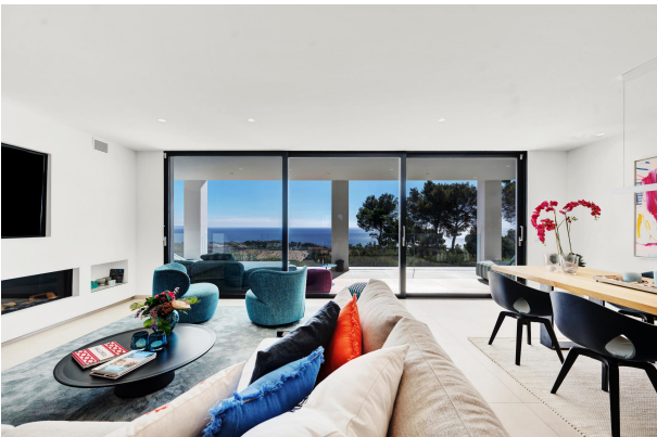
Living room with sea views