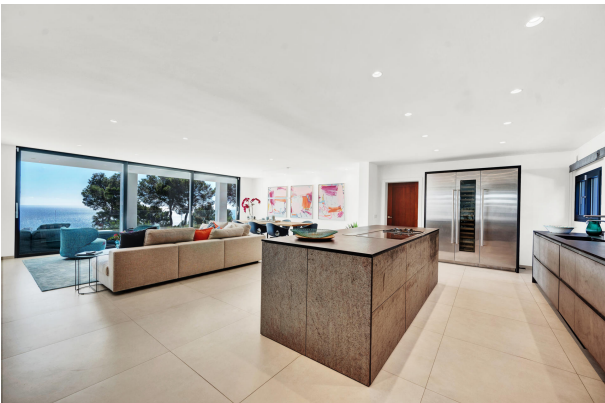
Villa for sale in Costa den Blanes