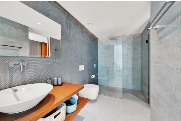
Guest bathroom en suite