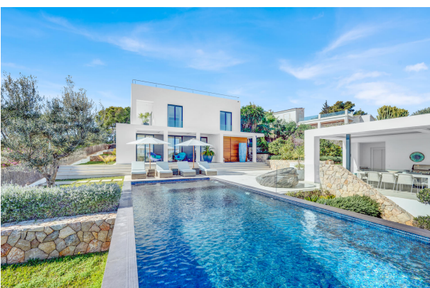
Modern sea view villa