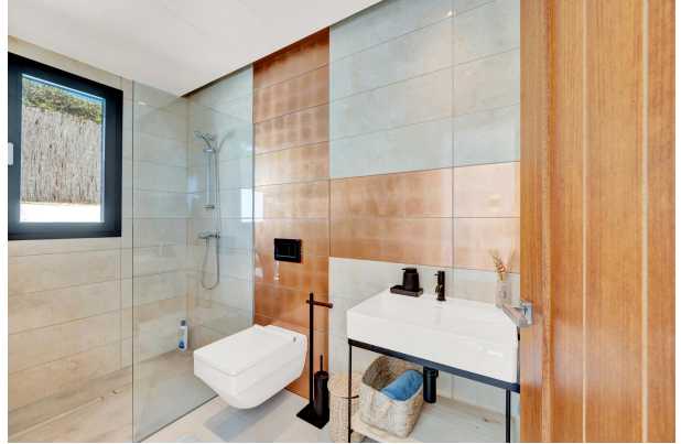
Bathroom by pool terrace