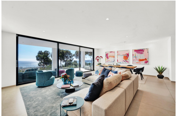
Sea view villa