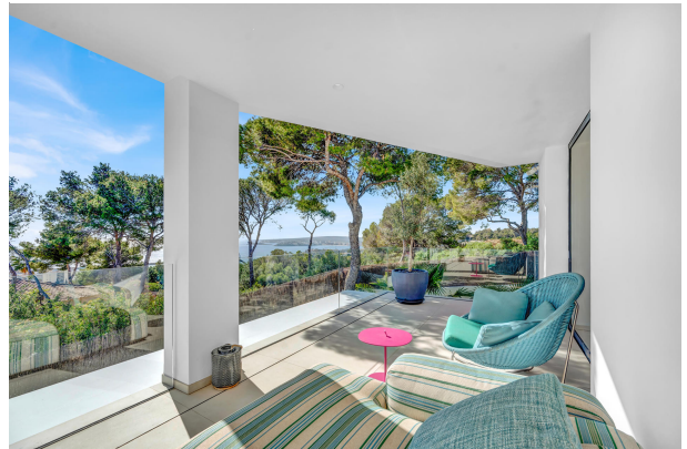
Sea view terrace KPO01716