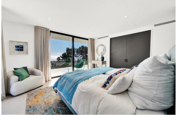
Master bedroom with sea views