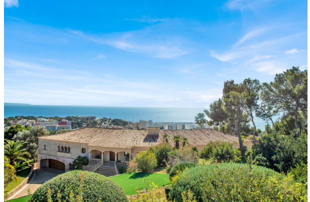
Panoramic sea view