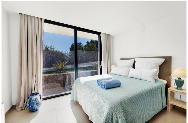
Bedroom in a sea view villa in Costa den Blanes