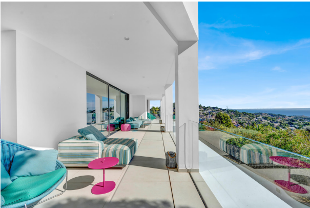
Stunning sea view terrace