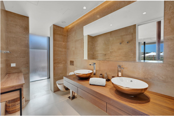
Bathroom in Costa den Blanes