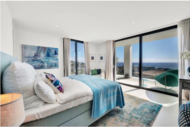
Master bedroom with panoramic view