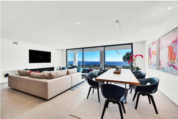
Living room in a villa