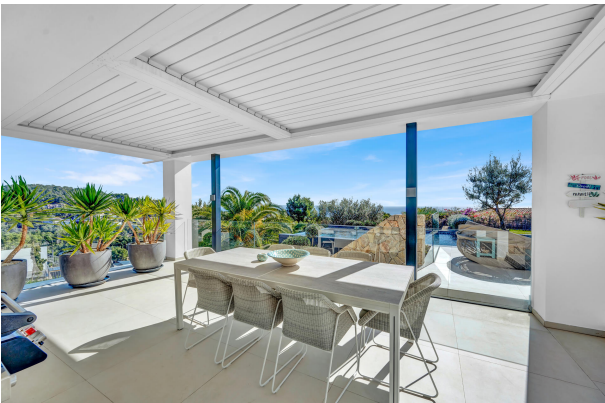
Pool terrace in Costa den Blanes