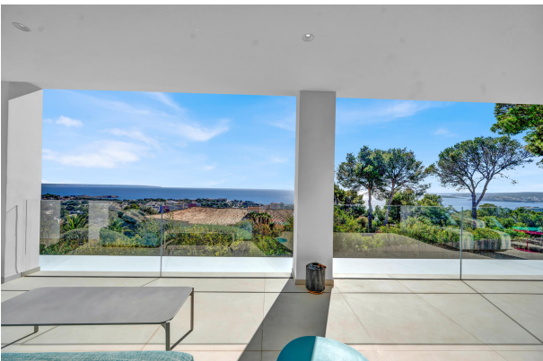
Terrace with sea views