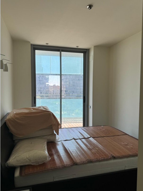
WhatsApp Image 2024-09-25 at 16.55.36