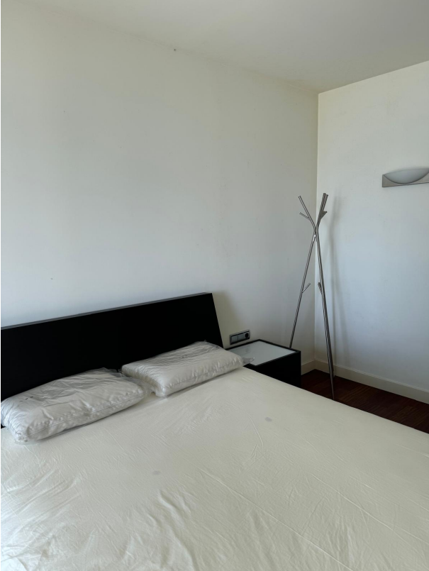
WhatsApp Image 2024-09-25 at 16.55.37