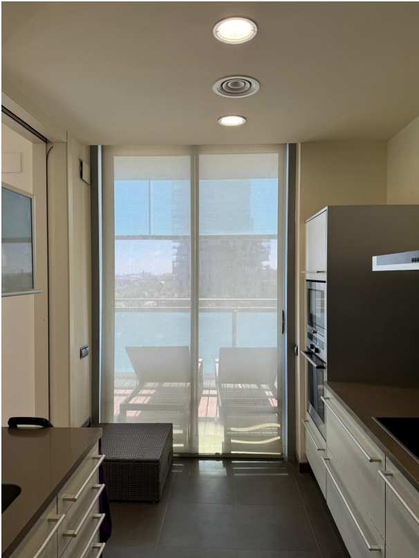
WhatsApp Image 2024-09-25 at 16.55.36 (2)