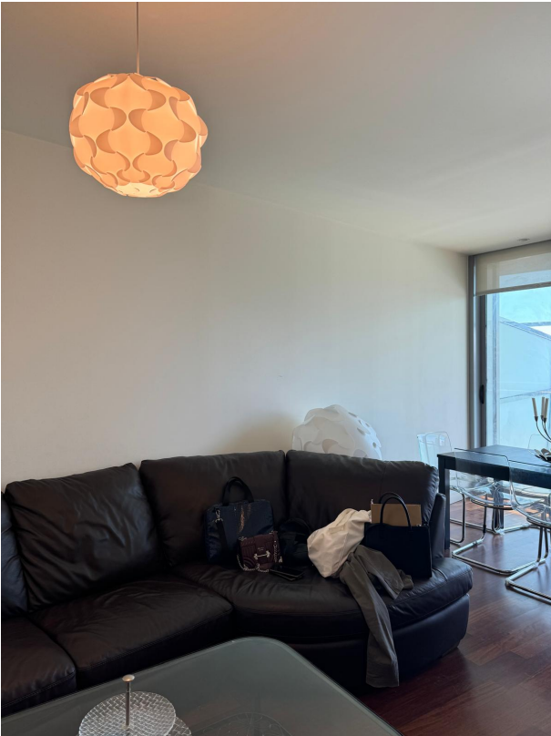
WhatsApp Image 2024-09-25 at 16.55.35 (3)