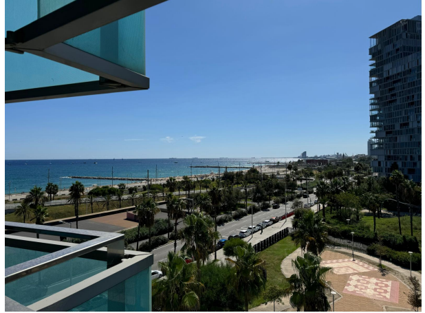
WhatsApp Image 2024-09-25 at 16.55.37 (1)