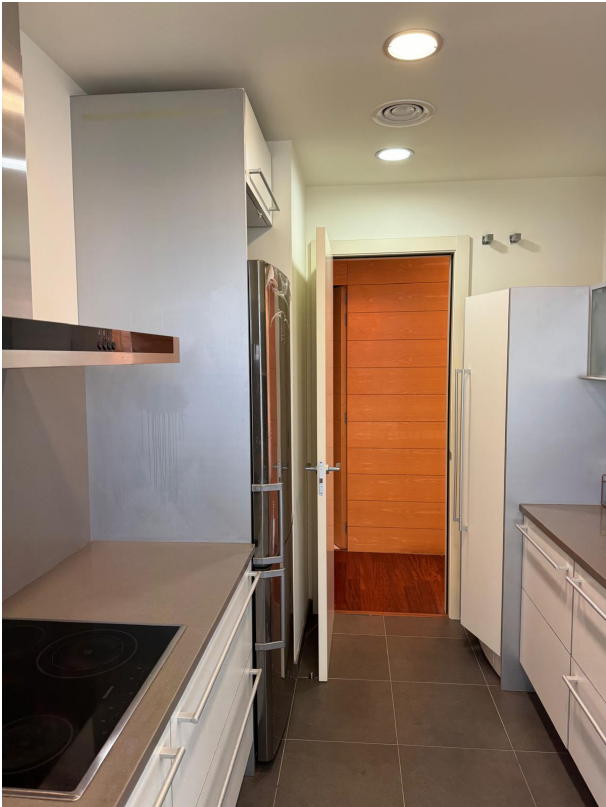
WhatsApp Image 2024-09-25 at 16.55.36 (5)