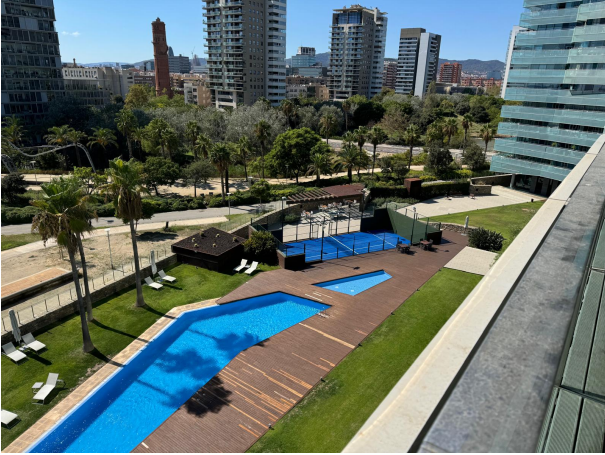
WhatsApp Image 2024-09-25 at 16.55.34 (1)