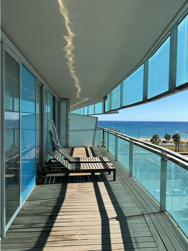
WhatsApp Image 2024-09-25 at 16.55.35