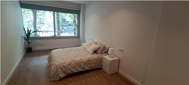
4. HABITACION 1