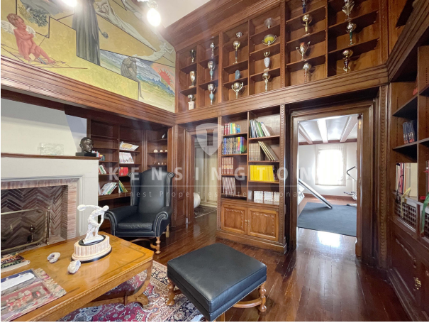
Gimnasio - altillo