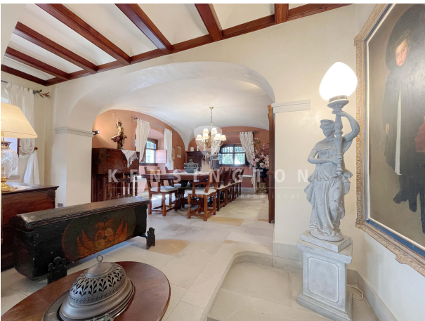
Comedor - bodega