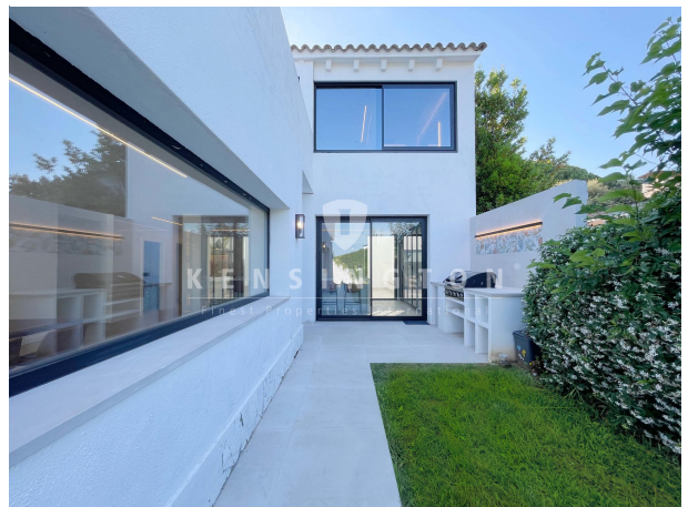
Porche - casa invitados