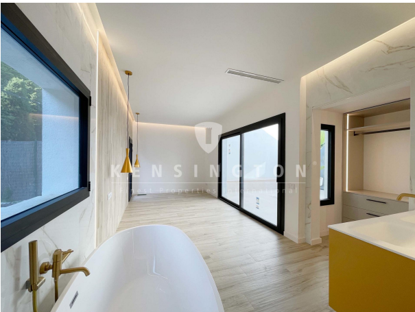
Terraza interior - suite en planta