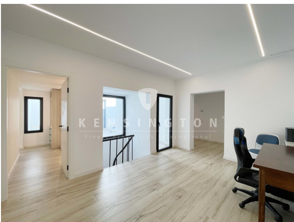
Vestidor - suite en planta