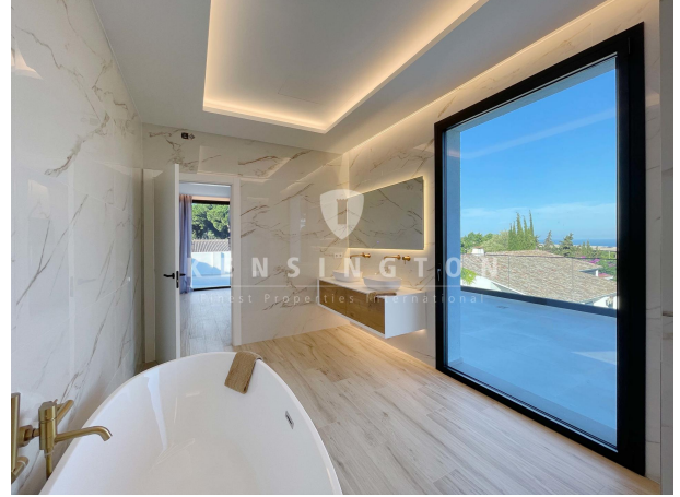
Vistas desde terraza