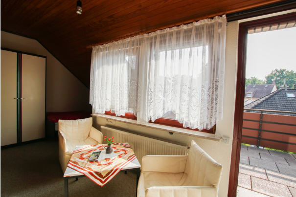
Zimmer 1 - OG