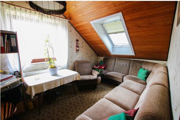
Zimmer 3 - OG