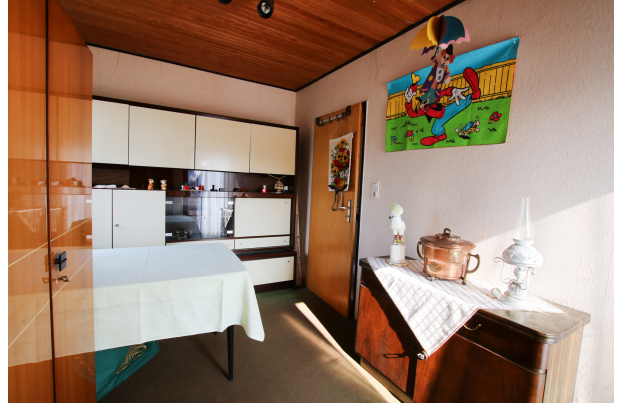
*Zimmer 2 - OG